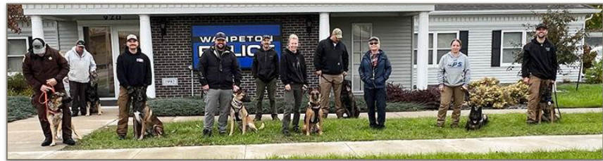
North Dakota Track Class

For upcoming 2024 Track Classes please check the web site: