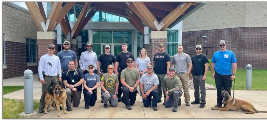
Marinette County WI Track Class