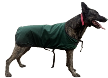
Oso wearing a cooling coat